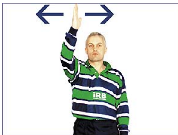
Lineout throw not straight