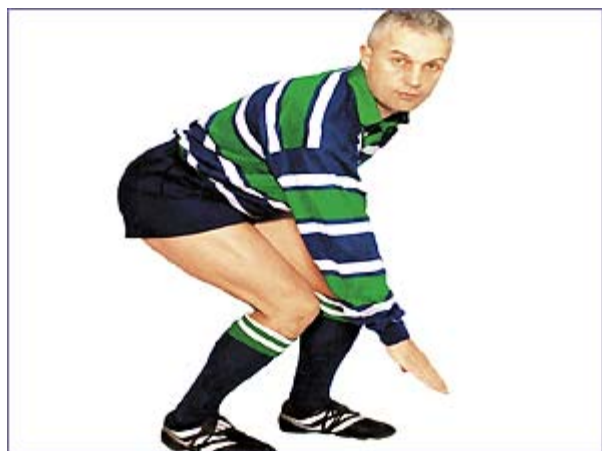
Handling in ruck