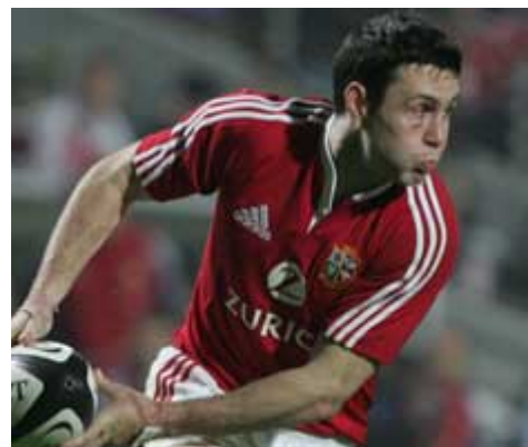
Two hands to pass.

The basic skills are passing, handling, catching, kicking, running, tackling, and managing contact.