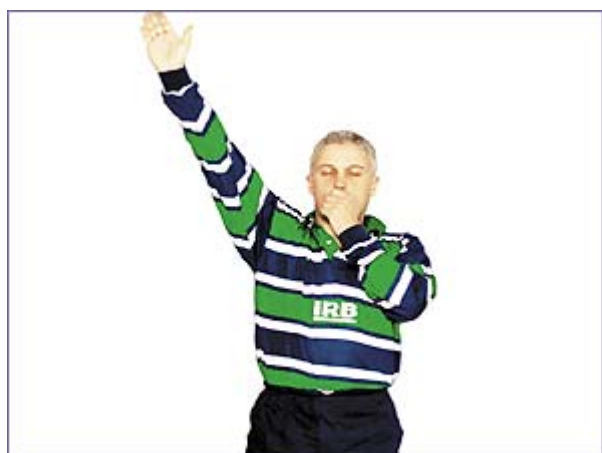
Penalty or Try