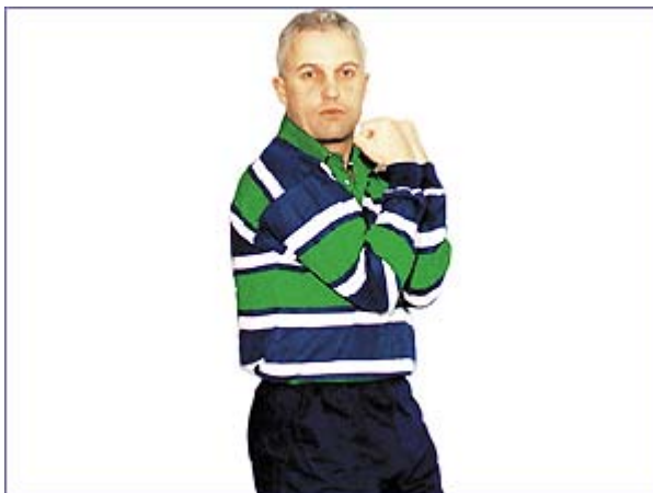
Ball Not Released