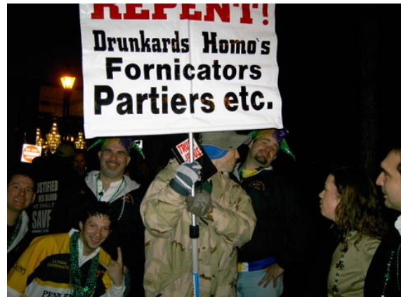
St. Patrick's Day Tournament – Savannah, GA

So welcome to the club -- join us to learn, play, and excel at the greatest sport on earth!