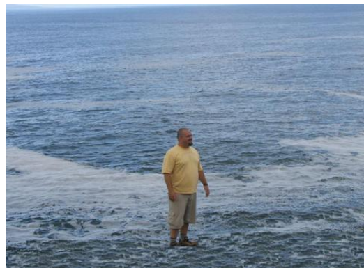
Thumper Walks On Water