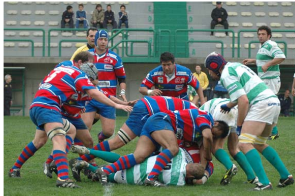
A ruck has formed.

Defense is a whole other subject, but suffice it to say that there's three types of defense. There's man-to-man defense , where each player is responsible for guarding one particular guy. There's zone defense , where each player is responsible for a certain area of the field. And there's drift defense , where the defensive line shifts as the ball moves out towards the other team's wing.